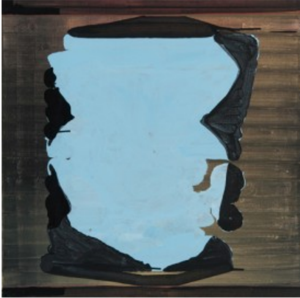
Gary Stephan, Untitled , 2013. Acrylic on canvas, 30 x 30 inches.

the shifting spatial relationships, the translucent paint handling, and the lush greens and deep blues satisfy.