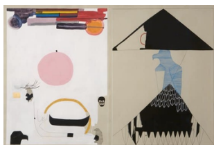
SHAUN O'DELL The Set of the Setting of the Setting of the Fight, of Light, 2007 Gouache and ink/paper 24 x 36 in. (SO0030)