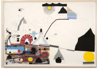
SHAUN O'DELL It was a Calibration of the Glass of the Underground Sun and the Unfolding of Light, 2007 Gouache and ink/paper 32 1/4 x 46 1/4 in (SO0012)