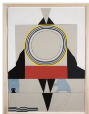
SHAUN O'DELL Black Mountain Blood Aperture, 2007 Gouache and ink/paper 30 x 21 3/4 in. (SO0018)