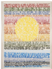
SHAUN O'DELL We Remember The Sun, 2007 Gouache, ink/paper 48 x 34 1/2 in (SO0004)