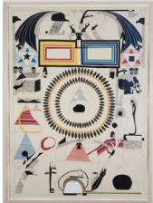
SHAUN O'DELL The Sound of the Kingdom of the Kingdom of Sound (b), 2007 Gouache and ink/paper 50 x 36 1/2 in (SO0011)