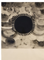
SHAUN O'DELL Just behind the Smoke, 2007 Gouache and ink/paper 30 x 21 3/4 in. (SO0020)