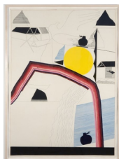
SHAUN O'DELL The Sound of the Kingdom of the Kingdom of Sound (a), 2007 Gouache and ink/paper 50 x 36 1/2 in (SO0013)