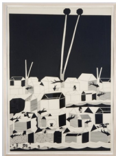
SHAUN O'DELL The Sound of the Kingdom of the Kingdom of Sound (c), 2007 Gouache and ink/paper 50 x 36 1/2 in (SO0007)