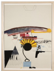
SHAUN O'DELL Undiscovered Planes, Right Here, 2007 Gouache and ink on paper 32 1/4 x 24 in (SO0006)