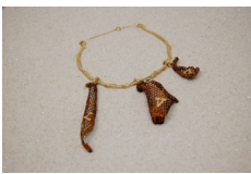
MYRANDA GILLIES Necklace , 2017 High-polish brass, found material, gold-coated chain (MG0011)