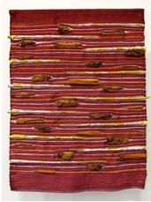
MYRANDA GILLIES Untitled (La Espanola), 2017 Monofilament, cotton, lurex, chile meco, cinnamon, lemongrass, emergency blanket 35 x 24 1/2 in. (MG0005)