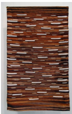
MYRANDA GILLIES Untitled (Top City #1, No. 2), 2017 Monofilament, cotton, lurex, cigarettes, burnt matches 41 x 25 in. (MG0001)