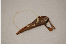
MYRANDA GILLIES Necklace, 2017 High-polish brass, pearl, found material, gold-coated chain (MG0010)