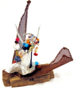
GEORGE HERMS Catch Me If You Can , 2017 Assemblage sculpture 13 x 11 x 9 in. (GH0032)