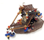
GEORGE HERMS Side Effects , 2017 Assemblage sculpture 11 x 17 x 11 in. (GH0033)