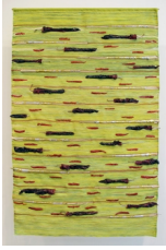
MYRANDA GILLIES Untitled (El Dorado) , 2017 Monofilament, cotton, lurex, chile guajillo, chile arbol, lemongrass, emergency blanket 49 x 29 1/2 in. (MG0004)