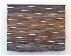
MYRANDA GILLIES Untitled (Top City #1, No. 1) , 2017 Monofilament, cotton, lurex, cigarettes 23 x 31 in. (MG0002)