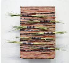
MYRANDA GILLIES Untitled (99, 79, 59), 2017 Monofilament, cotton, lurex, palm, woven plastic bag, khush incense, Bed of Roses incense 27 x 50 in. (MG0007)