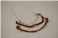
MYRANDA GILLIES Necklace, 2017 High-polish brass, pearls, found material, gold-coated chain (MG0009)