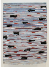
MYRANDA GILLIES Untitled (Tulcingo), 2017 Monofilament, cotton, lurex, chile mulato, chile arbol, tin foil 42 1/2 x 29 1/2 in. (MG0003)