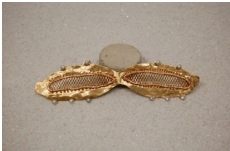
MYRANDA GILLIES Mask , 2017 High-polish brass, pearls, found material (MG0015)