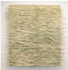
MYRANDA GILLIES Untitled (Jorge's No. 1), 2017 Monofilament, cotton, lurex, palm 85 x 82 in. (MG0006)