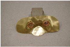
MYRANDA GILLIES Mask, 2017 High-polish brass, found material (MG0014)