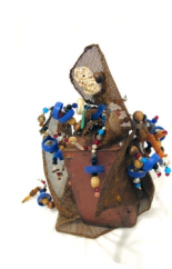
GEORGE HERMS So Anyway , 2017 Assemblage sculpture 19 x 17 x 15 in. (GH0036)