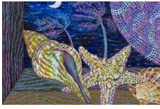
BENJAMIN DEGEN Offshore wind, 2016 Oil on linen 24 x 36 in. (BD0113)