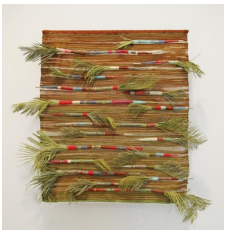
MYRANDA GILLIES Untitled (Jorge's No. 2), 2017 Monofilament, cotton, lurex, cypad 34 x 41 in. (MG0008)