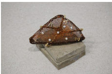
MYRANDA GILLIES Ring , 2017 High-polish brass, pearls, found material (MG0013)