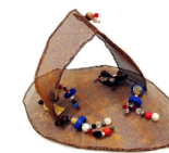
GEORGE HERMS Lil Bridge (Le Petit Pont) , 2017 Assemblage sculpture 15 x 22 x 17 in. (GH0037)