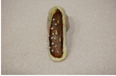
MYRANDA GILLIES Earring, 2017 High-polish brass, pearls, found material, hand-dyed silk tubing (MG0012)