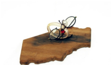
GEORGE HERMS Grand Embrace, 2016 Assemblage sculpture 5 x 12 1/2 x 6 in. (GH0034)