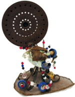
GEORGE HERMS Icon Artist , 2017 Assemblage sculpture 17 1/2 x 12 x 13 in. (GH0035)