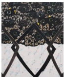
ALLISON MILLER Tropic, 2013 Oil, acrylic and pencil/canvas 60 x 48 in. (AM0045)