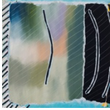
ALLISON MILLER Wave, 2013 Oil and acrylic/canvas 36 x 36 in. (AM0049)