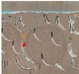
ALLISON MILLER Mine, 2013 Acrylic, dirt and oil/canvas 28 x 30 in. (AM0043)