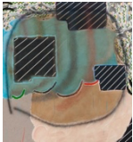
ALLISON MILLER Untitled, 2013 Oil, acrylic, dirt and pencil/canvas 66 x 60 in. (AM0044)