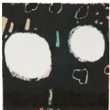
ALLISON MILLER Lock, 2013 Oil/canvas 30 x 30 in. (AM0047)