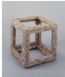
LUCAS SAMARAS Untitled, 1964 Pins on wood 18 x 18 x 18 in. (LS0001)