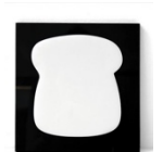
ROBERT WATTS Black Sandwich , 1964 Lucite 7 1/2 x 7 1/8 x 1 in. (RW0001)