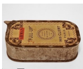
ARMAN Le Plein (Full Up) , 1960 Multiple of sealed sardine can filled with unknown material, perhaps trash, exhibition invitation on lid 4 1/8 x 2 1/2 x 1 1/8 in. (ARM001)