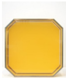
TONY DELAP Wijalba , 1967 Fiberglass, Plexiglass, lacquer paint, stainless steel and wood 12 5/8 x 12 5/8 x 3 1/2 in. (TD0001)