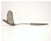
YAYOI KUSAMA Spoon with Penis , 1967 Cloth, metallic paint, spoon 4 1/2 x 12 1/2 x 2 1/2 in. (YKA0002)