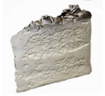
CLAES OLDENBURG Wedding Souvenir , 1966 Metallic paint on plaster of Paris 6 x 6 5/8 x 2 1/4 in. (CO0073)