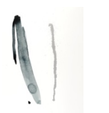
MARCIA KURE The Renate Series: The Mistress, 2012 Silver acrylic ink and watercolor / Arches HP Watercolor Paper, 300LB 30 x 22 1/2 in. Sheet 36 3/4 x 29 x 1 1/2 in. Framed (MK0064)