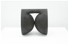
ERIC FERTMAN The Kiss, 2012 Black stained oak 12 1/4" by 11 1/2" by 8 3/4"