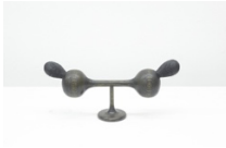
ERIC FERTMAN Fly, 2012 Black stained oak 5 1/2" by 12 1/2" by 2 3/4"