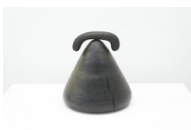
ERIC FERTMAN Foñ, 2012 Black stained oak 11" by 12" by 11"