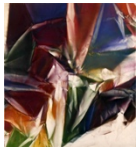
KEN SHOWELL UNTITLED , 1969 Acrylic on canvas 80" by 75" by 1 1/4"