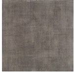
JACK WHITTEN DNA , 1979 Acrylic on canvas 42" by 42"