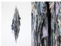
ELI PING Thrush , 2010 Cotton, gesso, dye, acrylic, and wax 96" by 25" by 9"