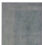
JESSICA DICKINSON Before-Behind , 2010 Gouache, colored pencil, conte crayon, and graphite on paper 44 1/2" by 42" / 47" by 44 1/2" by 1 3/4"