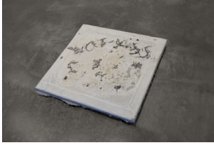
WILMER WILSON IV HOT-ASS , 2021 Poured bronze and concrete 1 1/2 x 34 1/2 x 35 1/4 in. (WW065)