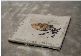
WILMER WILSON IV white ppl look at me and say "Black lives matter" involuntarily , 2021 Poured bronze and concrete 3 x 36 1/2 x 36 3/4 in. (WW062)