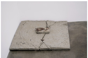
WILMER WILSON IV KING SLEEP , 2021 Poured bronze and concrete 5 1/4 x 35 1/2 x 35 1/2 in. (WW067)