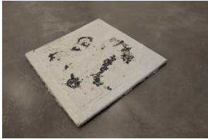
WILMER WILSON IV pristine window display , 2021 Poured bronze and concrete 1 1/2 x 34 3/4 x 36 in. (WW064)