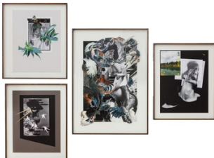
MARCIA KURE For Southern Kaduna (I-IV) , 2020 Mixed media Dimensions variable, four parts (MK0267)