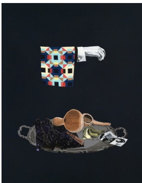
WILLIAM VILLALONGO Still Life with Quilt and Drinking Gourds , 2021 Acrylic and velvet flock on wood panel 72 x 56 x 2 in. (WV0223)