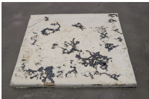
WILMER WILSON IV critical analysis Weak , 2021 Poured bronze and concrete 2 x 35 1/2 x 35 3/4 in. (WW063)