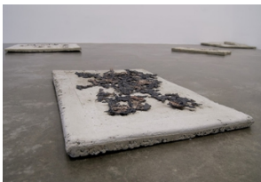
WILMER WILSON IV a dream has died , 2021 Poured bronze and concrete 1 1/2 x 22 x 36 in. (WW069)