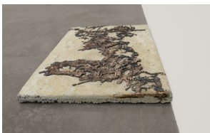
WILMER WILSON IV liquidity crisis , 2021 Poured bronze and concrete 1 1/2 x 35 x 23 in. (WW070)