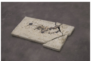
WILMER WILSON IV everyday I fight 4 my black ass life , 2021 Poured bronze and concrete 2 x 26 x 16 in. (WW068)