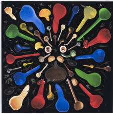
WILLIAM VILLALONGO A Seed is a Star , 2020 Acrylic, cut velour paper and pigment print collage 19 x 19 in. Sheet 24 x 24 in. Frame (WV0216)