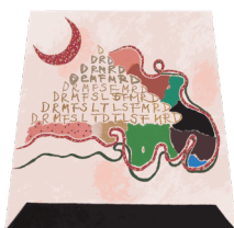
ALLISON MILLER Mirror , 2021 Oil stick, acrylic, and fabric on canvas 56 (height) x 45 1/2 (top width) x 58 1/2 (bottom width) in. (AM0148)