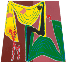
ALLISON MILLER Cameo , 2021 Oil, oil stick, and acrylic on canvas 56 (height) x 45 1/2 (top width) x 58 1/2 (bottom width) in. (AM0150)