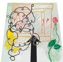
ALLISON MILLER Snow , 2021 Oil and acrylic on canvas 56 (height) x 45 1/2 (top width) x 58 1/2 (bottom width) in. (AM0146)