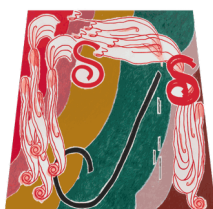
ALLISON MILLER Natural , 2021 Oil stick and acrylic on canvas 56 (height) x 45 1/2 (top width) x 58 1/2 (bottom width) in. (AM0151)