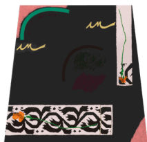
ALLISON MILLER Violet , 2021 Oil, oil stick, acrylic, and colored pencil on canvas 56 (height) x 45 1/2 (top width) x 58 1/2 (bottom width) in. (AM0147)