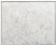
RYAN WALLACE The Unanimous Hour IX , 2020 Enamel, acrylic, canvas, linen, aluminum, copper and fiberglass 48 x 60 in. 50 x 62 in. framed (RW0241)