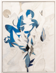
RYAN WALLACE The Unanimous Hour III , 2020 Oil, enamel, acrylic, canvas, aluminum, fiberglass tape on canvas 48 x 36 in. 50 x 38 in. framed (RW0235)