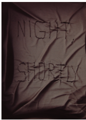
CHRIS DUNCAN Night, Shortly , 2018 Direct sunlight on fabric 26 x 18 in. (CD0008)