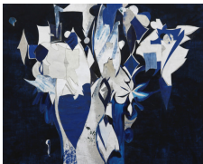
RYAN WALLACE Lenakaeia VI , 2018 Oil, enamel, acrylic, canvas, linen, wool, paper, masonite, aluminum, fiberglass, tape 48 x 60 in. (RW0192)