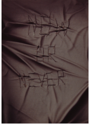
CHRIS DUNCAN Now Or Never , 2018 Direct sunlight on fabric 26 x 18 in. (CD0003)