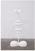
ERIC FERTMAN Totem , 2016 Ash and vinyl acrylic 44 1/2 x 22 x 9 in. (EF0217)