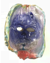
CHRIS DUNCAN Inside Mask , 2018 Ceramic 8 x 8 x 4 in. (CD0001)