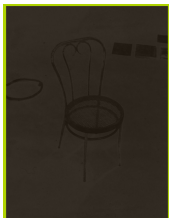
COLBY BIRD Chair , Los Angeles, 2014 Photostatic Print, charcoal, wood stain, wood, paint, acrylic, foam core, screws, adhesive 44 1/2 x 34 x 1 1/2 in. (CB0004)