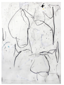
JOSEPH HART Untitled, 2017 Collage, acrylic and graphite on paper 40 x 30 in. (JH0005)