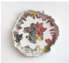
BRI RUAIS Attempting to Contain the Center, 135 lbs (Red and Yellow) , 2018 Glazed stoneware, hardware 44 x 44 x 7 in. (BR0001)