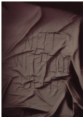
CHRIS DUNCAN Not Without Light , 2018 Direct sunlight on fabric 26 x 18 in. (CD0010)