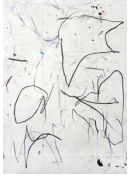
JOSEPH HART Untitled, 2017 Collage, acrylic and graphite on paper 40 x 30 in. (JH0004)