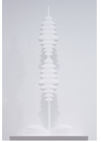
ERIC FERTMAN White Noise , 2016 Ash and vinyl acrylic 45 x 17 x 6 in. (EF0218)