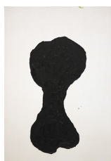
ANNE-LISE COSTE Ivory Black Little Bone, 2016 Oil paint on canvas 18 x 12 in. (AC0002)