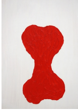
ANNE-LISE COSTE Vermilion Hue Little Bone , 2016 Oil paint on canvas 18 x 12 in. (AC0004)