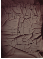
CHRIS DUNCAN Without The Sun / Fall Silent , 2018 Direct sunlight on fabric 26 x 18 in. (CD0002)