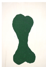
ANNE-LISE COSTE Chromium Oxide Green Little Bone, 2016 Oil paint on canvas 18 x 12 in. (AC0003)