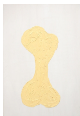
ANNE-LISE COSTE Naples Yellow Light Little Bone, 2016 Oil paint on canvas 18 x 12 in. (AC0005)