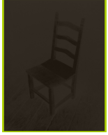
COLBY BIRD Chair, Bovina, 2014 Photostatic Print, charcoal, wood stain, wood, paint, acrylic, foam core, screws, adhesive 30 x 23 x 1 1/2 in. (CB0005)