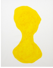
ANNE-LISE COSTE Bone (Yellow) , 2016 Oil on canvas 62 1/2 x 46 1/2 in. (AC0001)