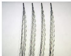
MAREN HASSINGER Rain , 1974 Galvanized wire and wire rope 92 x 50 in. overall 92 x 10 in. each (5 units) (MH0012)