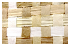
MAREN HASSINGER Whole Cloth , 2017 Muslin dyed with tea and coffee 62 x 66 in. (MH0008)