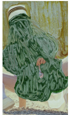
BEVERLY SEMMES Green Nurse , 2013 Ink on magazine page 7 1/2 x 4 1/2 in. 15 7/8 x 13 1/2 in. Framed (BS0119)