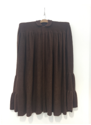
BEVERLY SEMMES Brown Gown , 1992 Mohair and hanger (single piece) 72 x 48 x 4 in. (BS0209)