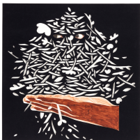
WILLIAM VILLALONGO Me Pile , 2018 Acrylic, digital photo collage on cut velour paper 19 x 18 5/8 in. Sheet 23 5/16 x 23 1/16 in. Framed (WV0181)