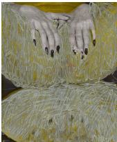
BEVERLY SEMMES Silver Mirror , 2014 Ink on magazine page 7 x 5 3/4 in. 15 x 13 1/4 in. Framed (BS0122)