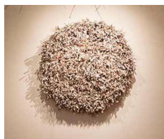
MAREN HASSINGER Our Lives , 2008/2018 Shredded, twisted and wrapped New York Times newspapers 72 in. dia. (MH0009)