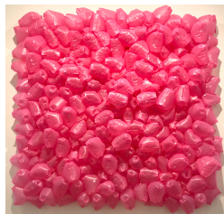
MAREN HASSINGER Love , 2008/2018 Pink bags filled with breath and love notes Dimensions variable (MH0013)