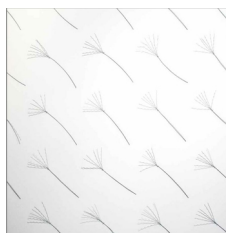
MAREN HASSINGER Consolation , 1974 Wire and wire rope 16 in. each (100 units) (MH0011)