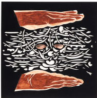
WILLIAM VILLALONGO Under Pressure , 2018 Acrylic digital photo collage on cut velour paper 19 x 18 5/8 in. Sheet 23 5/16 x 23 1/16 in. Framed (WV0183)