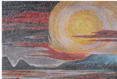
An Unkindness (detail; 2019), Robyn O'Neil. © Robyn O'Neil

This display looks at the differing approaches taken by three contemporary artists to the genre of narrative drawing. Robyn O'Neil's large-scale graphite compositions depict vast, forbidding landscapes - heaving oceans and desolate tundra wastes - populated by minute human figures; Annie Pootoogook's colourful depictions of Inuit home life depict a culture in flux and challenge stereotypical depictions; and Amy Cutler's magical realist fantasies conjure a fictional community of women living in hollowed-out tree trunks. The exhibition opens on 21 November (until 14 February); find out more from the Toledo Museum of Art's website.