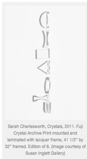
Sarah Charlesworth, Crystals , 2011. Fuji Crystal Archive Print mounted and laminated with lacquer frame, 41 1/2" by 32" framed. Edition of 8.

Posted on April 10, 2012 by Lynn Maliszewski