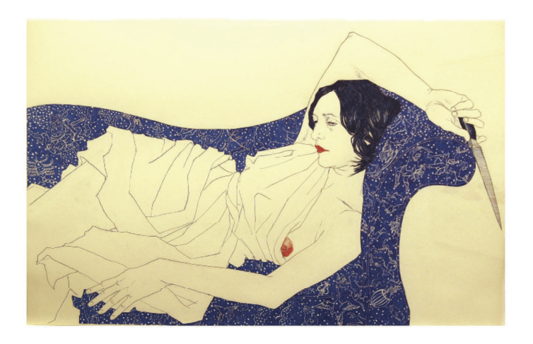
Hope Gangloff "Salomé", 2009. Ink/clay-coated paper, 25 1/4" by 37" / 27 3/4" by 40" by 1".