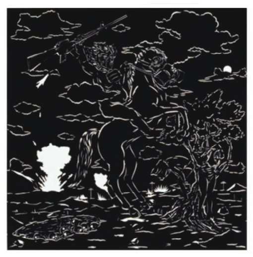
William Villalongo "The Wild, Wild West!" 2007. Velour paper, 39" by 39" / 42 1/2" by 41 3/4".