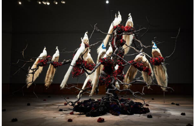
A sculpture by the artist Petah Coyne (Untitled #1383 (Sisters—Two Trees), from 2013–2023 at the Pennsylvania Academy.

In a gallery at PAFA once filled with 19th-century marble figurative sculptures. Petah Covne's majestic black tree now holds the floor. Its boughs are weighted with more than a dozen white peacocks, as if in conversation. She described it as symbolic of her generation, whose members are now in their 70s and 80s. "A lot of us are disappointed," Coyne said of the dream of democracy. "My generation tried very hard but I think we failed." Imaae