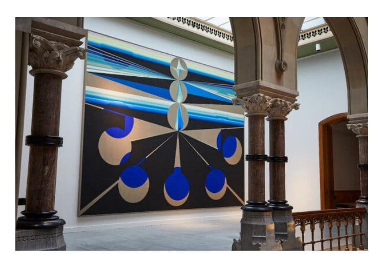
"Black Medallion XIV (Inti)" (2022) by Eamon Ore-Giron at the top of a stair at PAFA.

"These works are meant to position the viewer in a space where they are interpreting dawn and dusk," said Ore-Giron, who has depicted both transitional moments as fundamentally similar rather than opposite. "America's filled with this weird duality. To me this two-part exhibition structure just reinforced the idea of perspective."